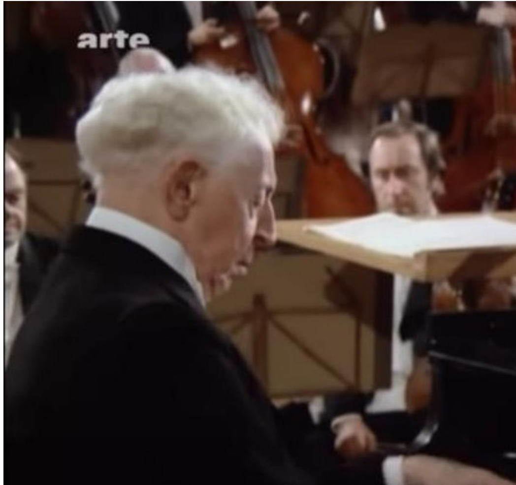
Arthur Rubinstein, piano; LSO, André Previn, conductor https://www.youtube.com/watch?v=T_GecdMywPw