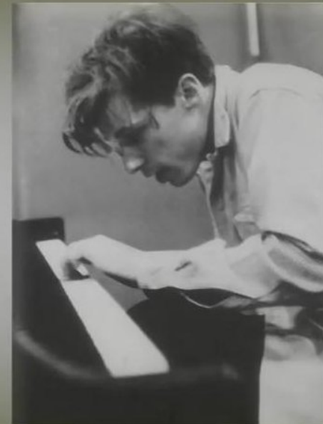
Glenn Herbert Gould