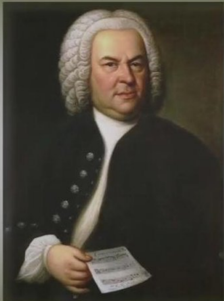
Johann Sebastian Bach