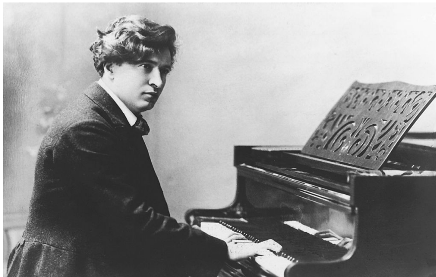
Busoni ~ 1895

https://www.youtube.com/watch?v=B3CvoDLh2bU